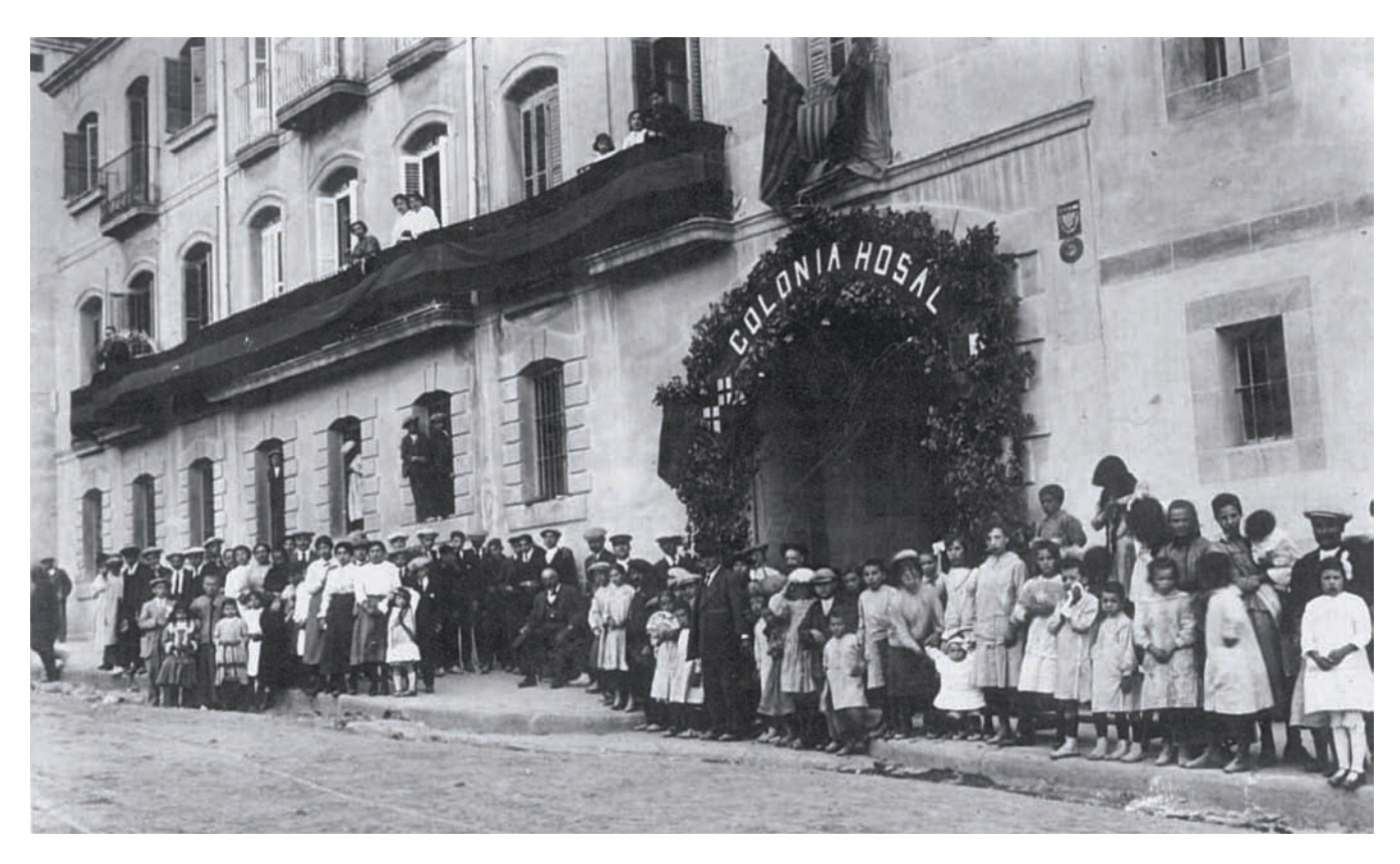
Figure 4. The workers at Colònia Rosal in Berga awaiting the arrival of King Alphonse XIII. The monarch took a 15-day trip to Catalonia in October 1908. In addition to visiting Barcelona, he also travelled along the Llobregat River valley and visited some of the most important colonies.

cia and the Passeig itself were their stomping grounds, and just like the other textile industrialists they opened their businesses in the area falling between Ronda Sant Pere, Trafalgar and Ausiàs Marc streets and Passeig de Sant Joan. They kept a luxurious residence, their "torre", in the colony. These industrialists, who were one in a crowd in Barcelona, were the masters of the colonies, towns and counties. Their influence extended beyond the geographic boundaries of their colonies and spread to the towns and county seats. During the years of the restoration of the House of Bourbon's monarchy after 1875, they actively participated in local and county politics; they served as the mayors of the county seats, provincial councillors and deputies and senators in the Spanish courts.