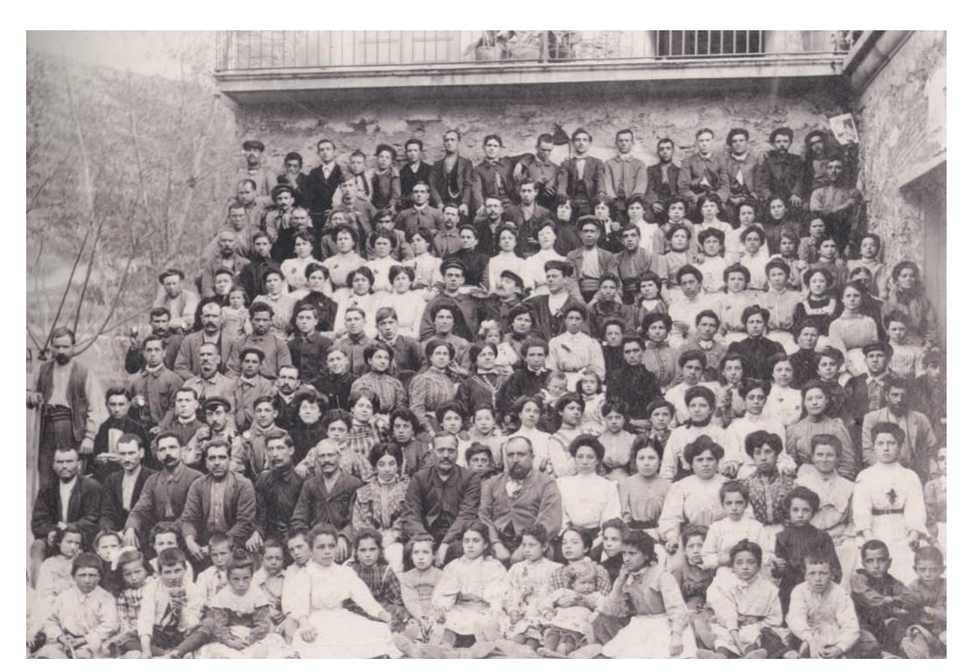
Figure 5. Factory staff at Rifà in Ripoll, in 1910.

The second wave in the early 20th century mainly involved families coming from agricultural counties in crisis, such as the countryside in Tarragona, Lleida and La Franja de Ponent (the westernmost part of Catalonia touching Aragon), and even the border region between Aragon and Valencia, along with Murcia and Valencia in the 1920s and 1930s. Each colony created its own recruitment network which provided jobs for relatives, neighbours and friends from specific places around Spain, especially southern Spain but also León, Galicia and Andalusia. This dynamic continued steadily until the onset of the crisis in 1973.