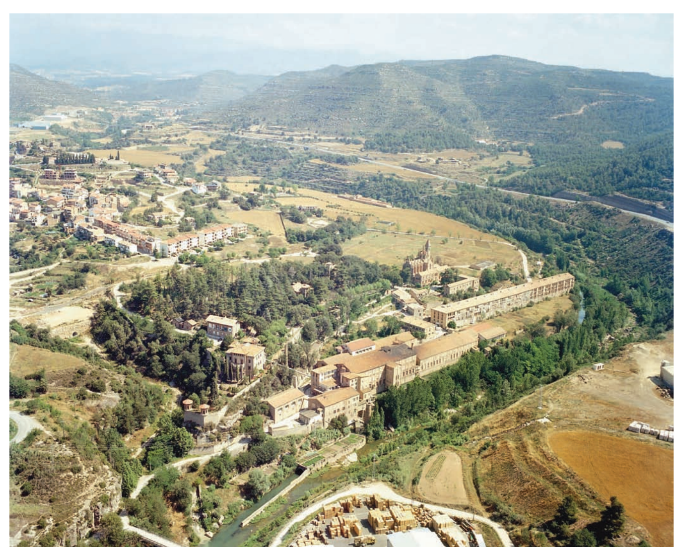
Figure 7. Colònia Pons in Puig-reig in an aerial picture that shows the monumentality of some of its structures. It was built between 1875 and 1890 at the base of the Llobregat River. On the left, in the foreground, the owners' house; in the middle ground, the offices and factory, and behind them, the workers' homes; in the background, the school and church. And in front of everything, the Llobregat River, the life and soul of the colonies built along its banks.

Industrial colonies in Catalonia Cat. Hist. Rev. 4, 2011 117