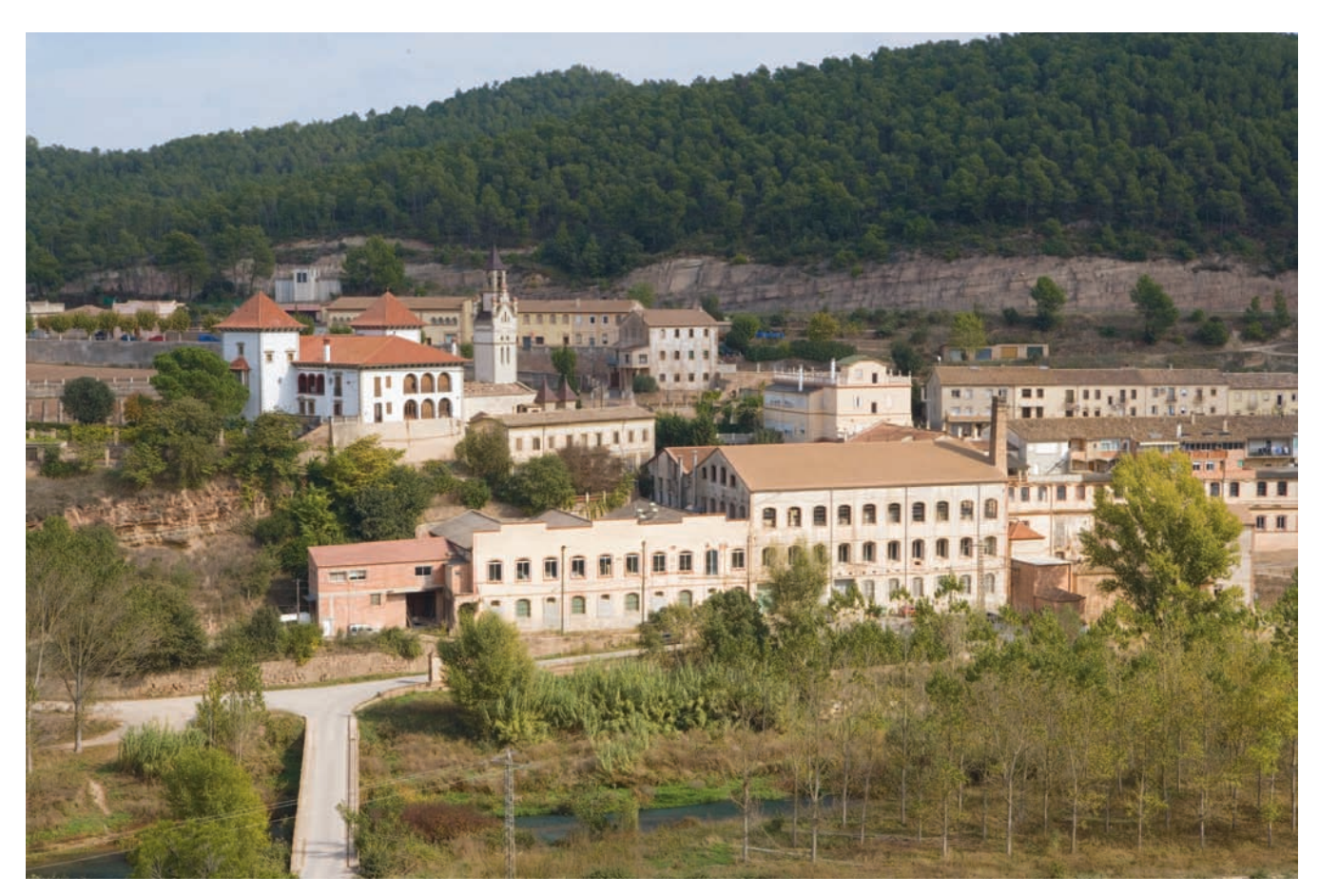
Figure 3. General view of Colònia Palà Nou on the Cardener River.

This Mediterranean river – an unruly, quick-flowing, all too often dry and repeatedly torrential river – which crosses our country from north to south and divides it in half, is the only river in Catalonia that leads directly from the mountains to the sea, from the vast, empty spaces to the conurbation of Barcelona. Upriver, in its middle and upper course, the Romans' Rubricatus – which got its name from the reddish tones of the land where it starts and because whenever it rises it flows turbid, dark, muddy and slippery, that is, lubricatus – is a murky river, as it runs through mountains full of forests that shade it. What is more, it is the hardest-working river, that is, the most heavily used and exploited river in the world; the great geographer Pierre Deffontaines summarised it with a masterful phase that has been oft repeated: "Perhaps no river