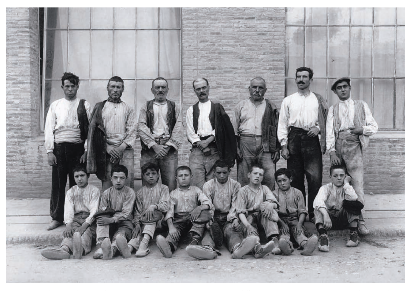
Figure 6. Workers at Colònia Güell (approx. 1915). The men and boys were given different jobs than the women.

Industrial colonies in Catalonia Cat. Hist. Rev. 4, 2011 11: